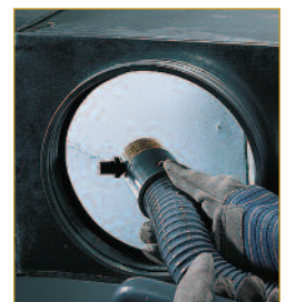
Inhibits growth of mold and mildew for months.